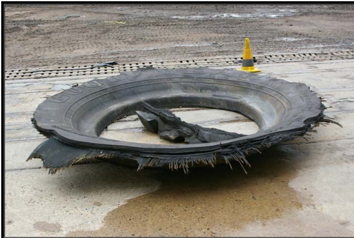
Figure 3: Tyre side wall from position number 1