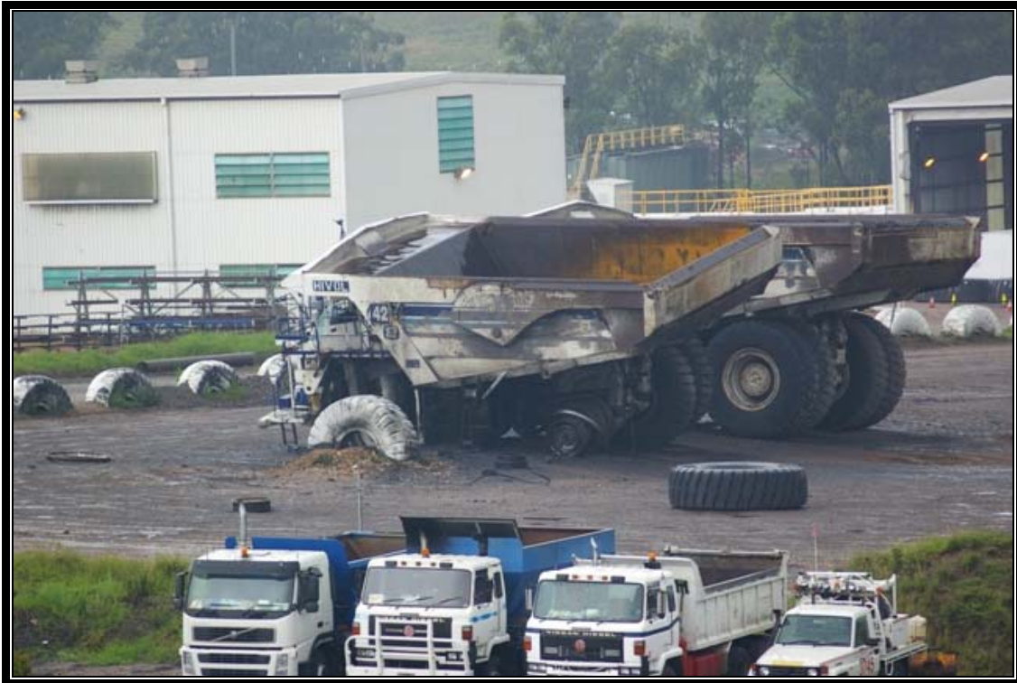
Figure 2: Close-up of the truck