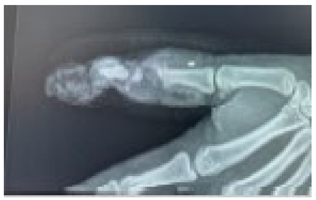
Figure 1: An X-ray showing the thumb injury

An agitator operator suffered a crush injury to the left thumb, which required surgery. The operator was clearing material into the rear of the bowl when rotating machinery made contact with the operator's thumb.