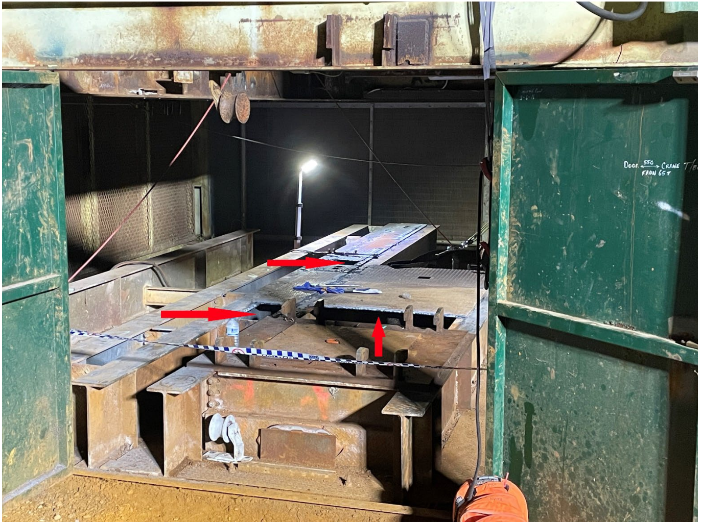
Figure 2: Incident scene with red arrows showing areas where the shaft was exposed when the incident occurred

Initial inquiries indicated that fall prevention and/or fall arrest equipment was not used at the time of the incident.