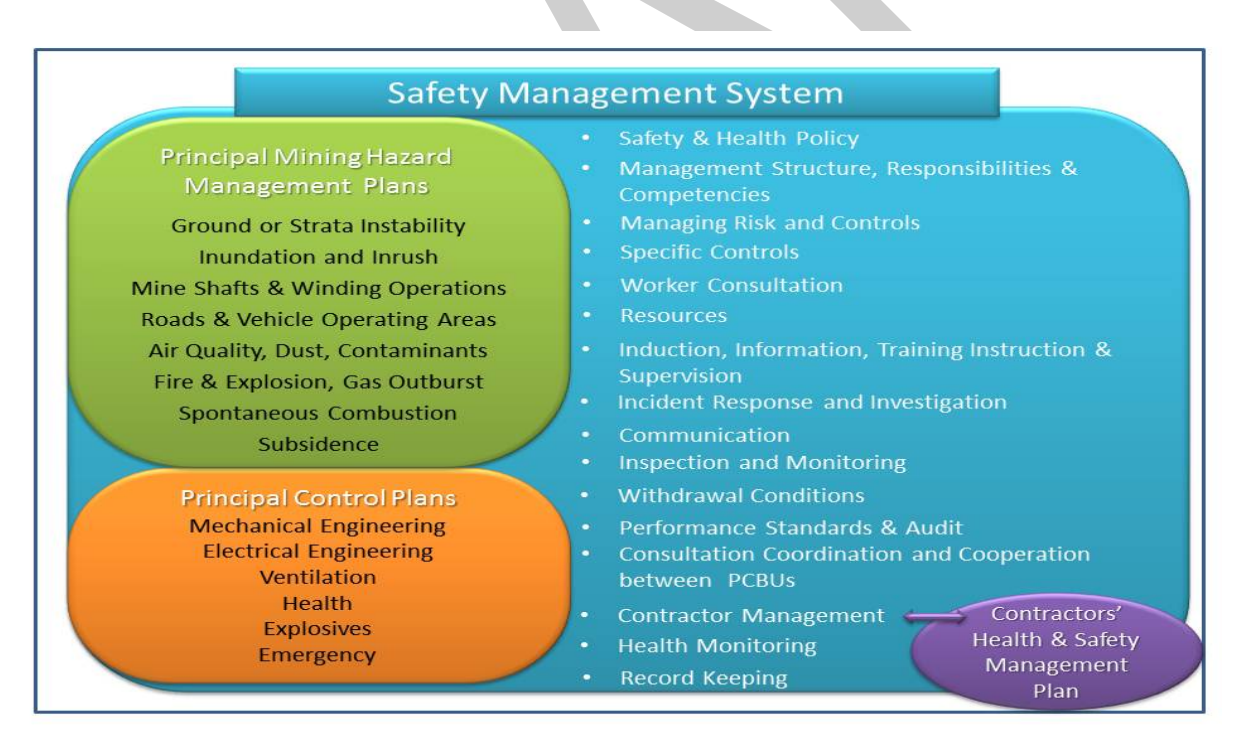
Figure 2: the mine safety management system

Figure 2 below shows the SMS and the relationship of PCPs, PMHMPs and specific control measures.