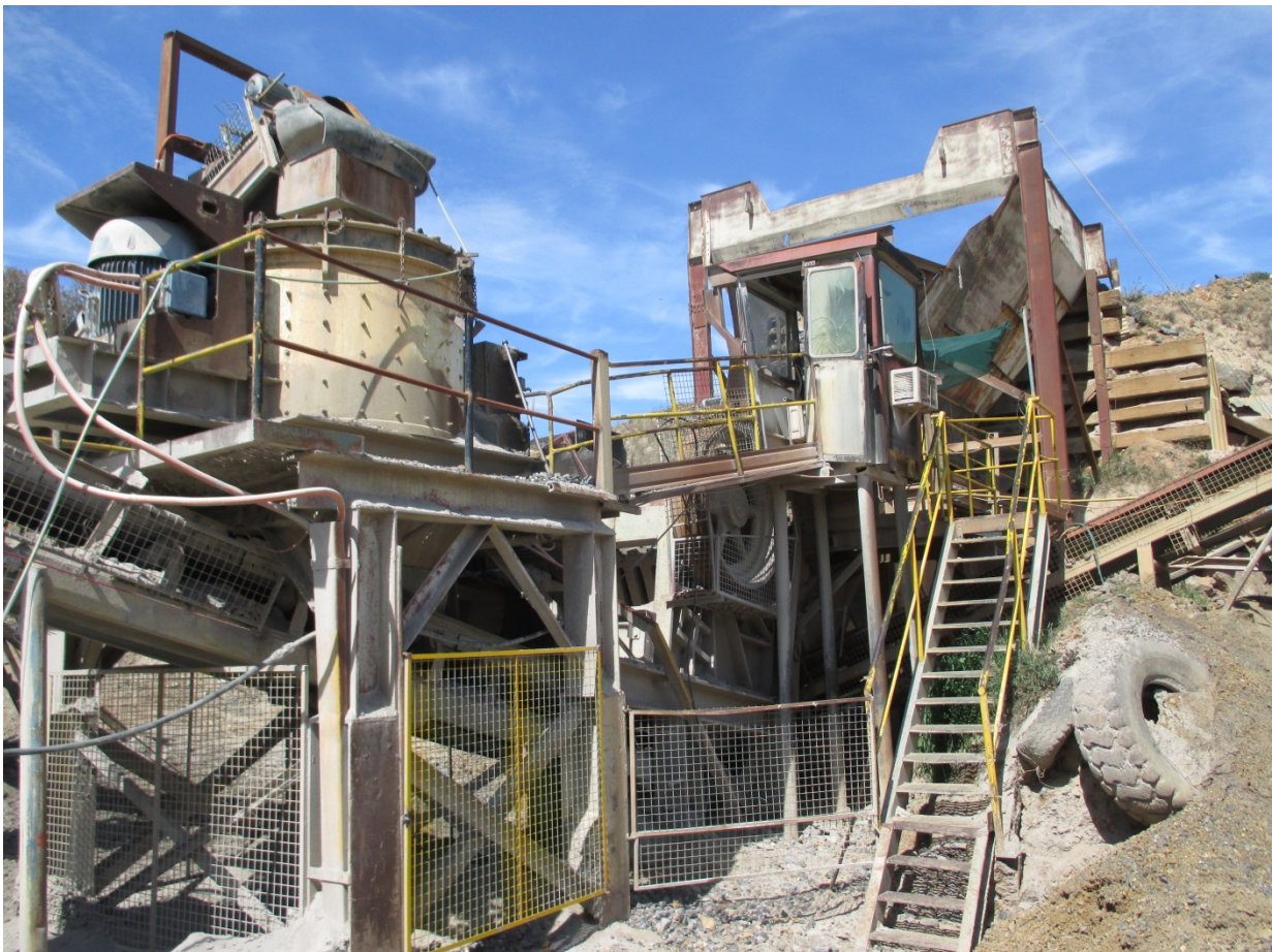
Image 1: Photograph of the quarry crushing plant taken by an investigator on 15 September 2014.

A woman was found deceased in a house near the Cudal Limestone Quarry. The house was supplied with electricity from the quarry's electrical supply. The deceased woman appeared to have suffered a fatal electric shock.