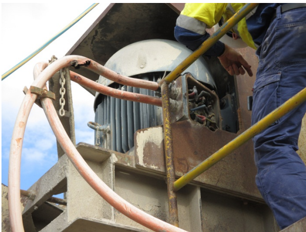
Image 2 & 3: Photographs of the crushing plant motor power supply taken by an investigator on 15 September 2014.

A phase to earth fault was identified on a motor supply cable. The protective insulation was damaged inside the motor terminal box and there was evidence of arcing and high temperature damage to a motor supply cable at a metal support arm near the terminal box.