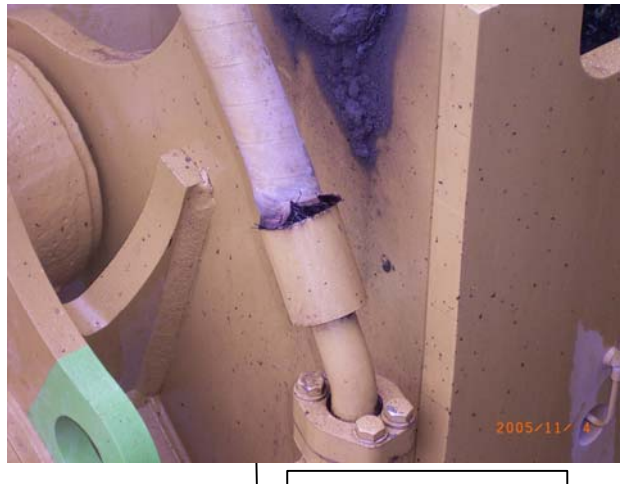
Corroded hose end

Further investigation with the OEM revealed a safety bulletin had been released in the USA and Canada on the 26 October 2005 highlighting the issues that led to this very same incident.